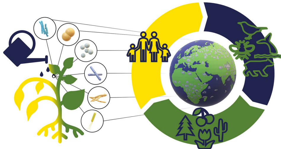
Fig. 3 Plants are the centerpiece of One Health components, and their growth and productivity are directly linked to the microbiome. Targeted microbiome management, that supports native functions of symbionts and reintroduces them where depleted, will improve sustainability and planetary health

the “One Health” concept of the World Health Organization (WHO), In addition the “Planetary Health” concept includes environmental health and its relationship to human cultures and habits (Flandroy et al. 2018). The signatures of the plant microbiome in the Anthropocene in relation to the inter-connected microbiome may result in intensified shifts, and result in a global microbiome imbalance. The absence of important symbionts in crop plants is recognized, missing microbes in native plants or wildlife are currently less considered. Peixoto et al. (2022) argued for microbiome stewardship for these organisms because they harbor great potential for restoration of endangered ecosystems.