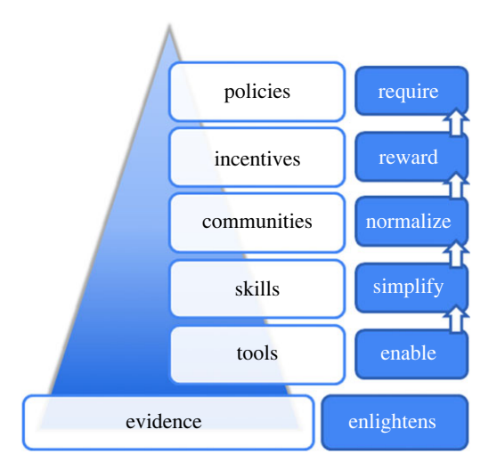
Figure 2. An integrated, evidence-based approach to fostering the growth and spread of Open Research, adapted from Nosek [96].